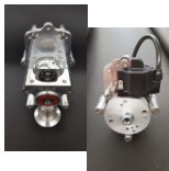
GZR New 2020 Side Exhaust 6061-T6 Billet Alum Crankcase.